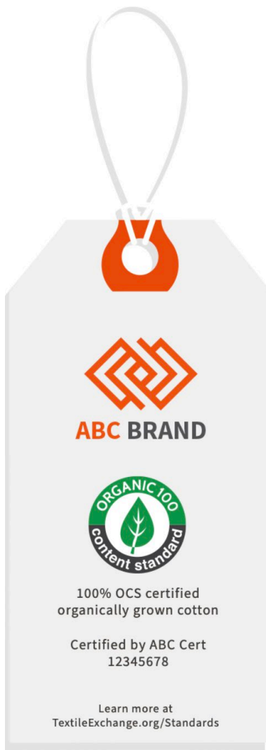
Product-related claim (on-product): OCS