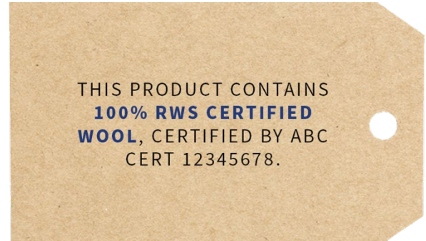
Product-related claim (on-product): RWS