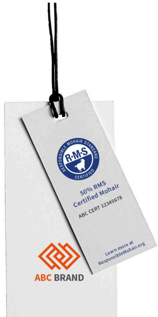
Product-related claim (on-product): RMS